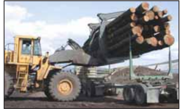
Members of the Colville Confederate Tribe harvest the abundant, high quality Ponderosa Pine and Douglas and White Fir that has grown on the 1.4 million acres of tribal land that they share.

Omak, Wash. —Members of the Colville Confederate Tribe have made good use of the abundant, high quality Ponderosa Pine and Douglas and White Fir that has grown on the 1.4 million acres of tribal land that they share. Since Colville Indian Precision Pine (CIPP) was incorporated in 1984 to provide a steady flow of income from the tribe's forest and provide employment opportunities for the tribe and local communities, success has been sustained.