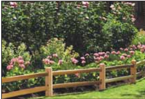
Cedar split rail fencing, shown here, is one of many products produced and sold by Idaho Timber.