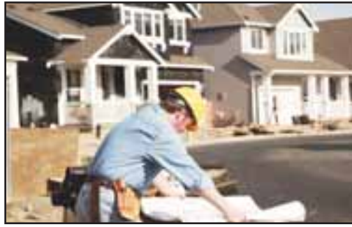
A homebuilder plans a project with RealPost, an ICC-certified structural porch post marketed by Woodtone.