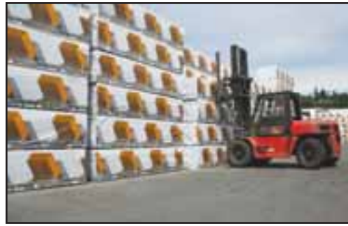
A forklift prepares to move some products at Woodtone's facility in Chilliwack, B.C.

RealCorner™ is an exterior inside/outside corner application available in a variety of profiles designed to save time on the job site as crews no longer need to build up corners in the traditional method. RealCorner™ is a favorite for both single