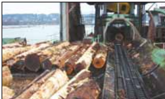
This is a photo of a debarker discharger at the Bridgeview Mill in Surrey, B.C.