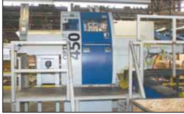
The Weinig 450 OptiCut is known as the "fastest saw in the world."