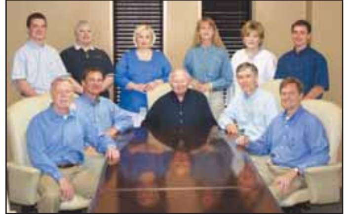
McGinnis Lumber Co. attributes a large part of its success and longevity to its employees, including some who have worked at McGinnis for over 30 years.