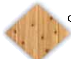
New Cedar Craft Panels