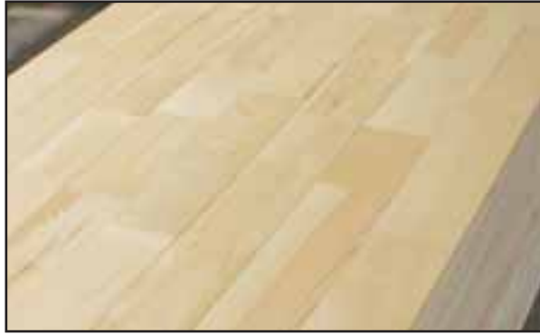
This is a photo of Clear Eastern White Pine finger-joint ready to be primed at Mill Services Inc., headquartered in Cobleskill, N.Y.