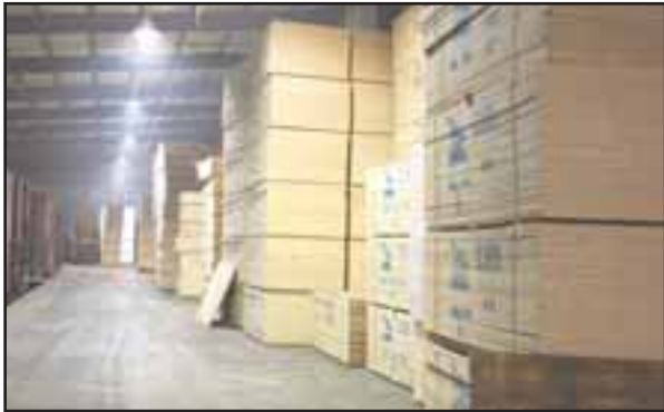
Colville Indian Precision Pine (CIPP), located in Omak, Wash., manufactures 65 million board feet of lumber annually, specializing in Ponderosa Pine Shop and boards, including 4/4 and 6/4.