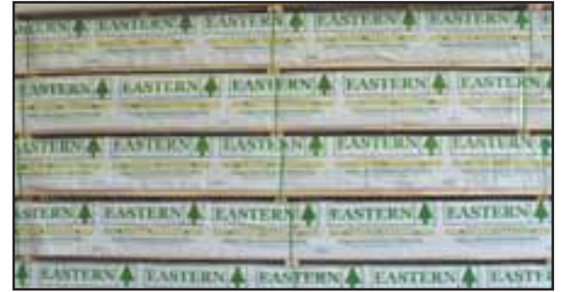
Clear finger-joint (all 16-foot) is shown paper wrapped and ready to be shipped.

Cobleskill, N.Y. —At Mill Services Inc., the key to success is all about building lasting relationships and providing consistent quality products from start to finish.