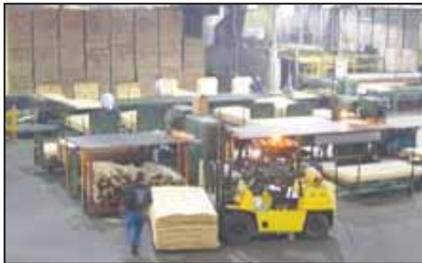
Colville Indian Plywood and Veneer (CIPV), which shares the Omak property, produces dry veneer, plywood, sanded and underlayment, and produces 150 million board feet of product annually.