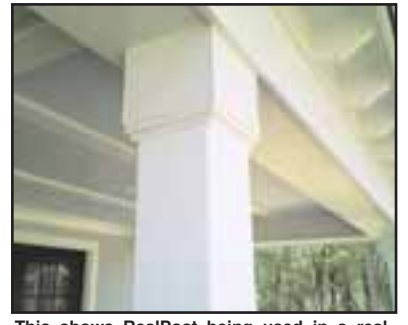
This shows RealPost being used in a real-world application.

and multi-family users due to the variety of lengths and patterns.