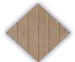
New Craftsmen Panels Shown 4"oc